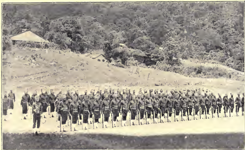
“ MY SEPOYS DRILLING.”